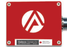
GALEOS Series 2+